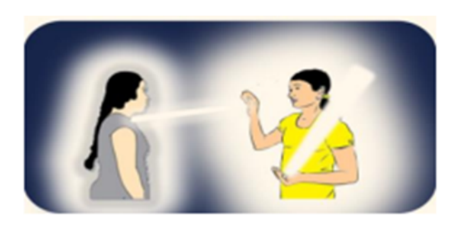
Fig. 1: Channelling of energy from the healer to the patient

Yoga Prana Vidya (YPV) is a no touch and a no medicine proximal or distant healing modality which is based on the principle that our body has the ability to heal itself or normalise itself and this process can be accelerated if the flow of prana or energy in our system is regulated and enhanced. YPV is a holistic and an integrated healing modality which uses breathing exercises, forgiveness sadhana, meditation techniques, physical exercises and energy healing to cure any physical or psychological ailments generally as complementary medicine, though there have been instances where YPV modality was successfully applied as alternative medicine when there was no treatment available in main stream medical system.