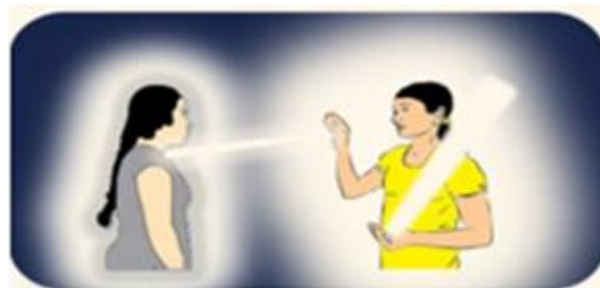
Fig 1: Channelling of energy from the healer to the patient

Yoga Prana Vidya (YPV) healing system is a holistic and as alternative healing approach that can also be used as a complementary medicine for treatment of physical, psychological, mental and emotional illnesses by proximal or distant healing modality. YPV is based on bio-plasmic energy or prana that involves no-touch and no-drug treatment principle.