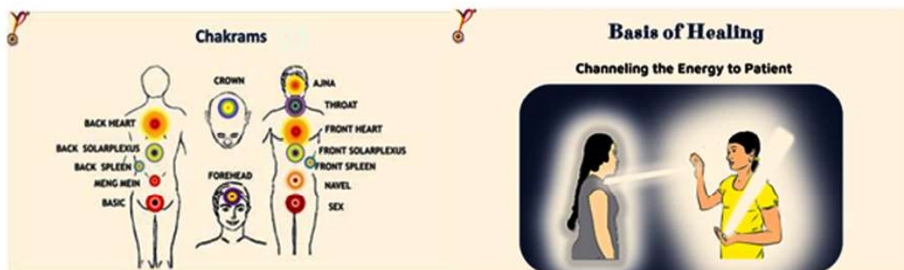
Fig. 3: Chakram of the energy body

internal organs as well as to the respective Chakrams of the energy body which distribute the given energy to the energy body and physical body.