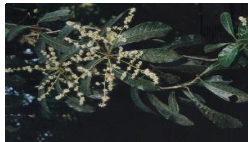
Figure 1: Holigarna ferruginea Marchand.

family Anacardiaceae, was seen in 4 patients. In three cases, the diagnosis was confirmed by patch tests. The presence of pyrocatechol in the acrid juice was detected by simple laboratory procedures. 3