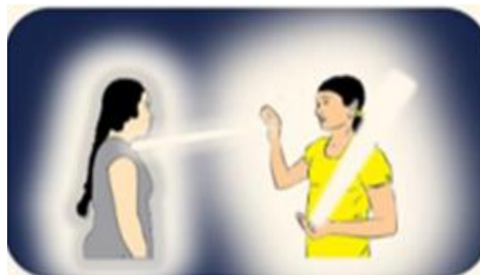
Fig 1: Channelling of energy from the healer to the patient

meditation techniques, physical exercises and energy healing to cure any physical or psychological ailments, generally as complementary medicine, though there have been instances where YPV modality was successfully applied as alternative medicine when there was no treatment available in main stream medical systems.